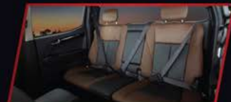
3 point seat belt