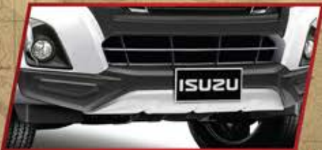
Front Bumper Guard