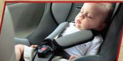
Isofix Anchorages for Child Seat