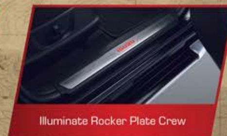
Illuminate Rocker Plate Crew