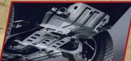
Steel Underbody Protection