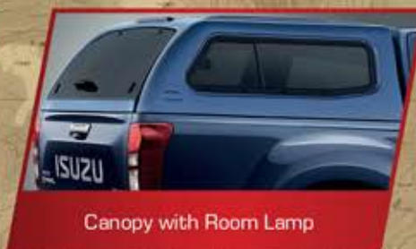
Canopy with Room Lamp