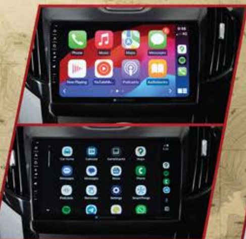
Integrated 22.8 cm (9 inch) Touchscreen Entertainment System with wireless Android Auto/Apple Car Play

Its intuitive design and ergonomic styling make the V-Cross an incredibly luxurious ride. So whether you're picking the kids up from school or driving off road on a glamping expedition, you're always in a safe, comfortable cocoon.