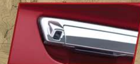
Rear Parking Camera