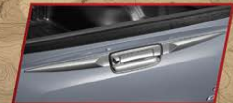
Tail Gate Ornament