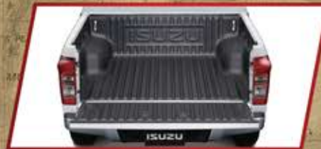
Bed Liner Under Rail