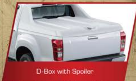
D-Box with Spoiler