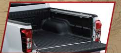
Cargo Rails Crew