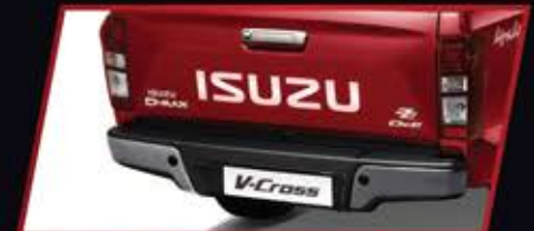
Rear Bumper with Dark Grey Finish

The ultimate adventure utility vehicle is here. To conquer all terrains, to transform your weekends. Rugged, stylish, comfortable, powerful: the V-Cross is designed to go as far as your imagination can.