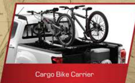
Cargo Bike Carrier

Choose from a wide array of accessories to enhance your V-Cross experience.