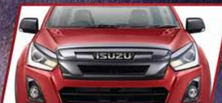
Aggressive looking dark grey grill in Front with Headlamp Garnish