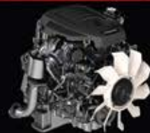
1.9L Diesel Engine with 120 kW (163 hp) Power & 360 Nm Torque