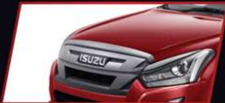
Dark Grey Engine Hood Garnish