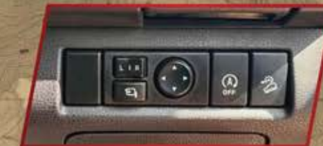
Idle Stop System (ISS)