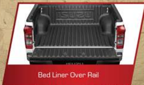
Bed Liner Over Rail