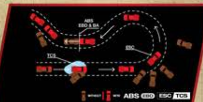
Electronic Stability Control (ESC) Traction Control System (TCS)