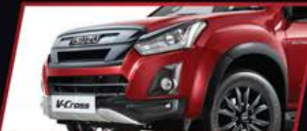
New Front Bumper Guard finished in Two Tone colour Dark Grey and Matt finish off white.