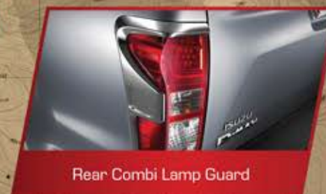
Rear Combi Lamp Guard