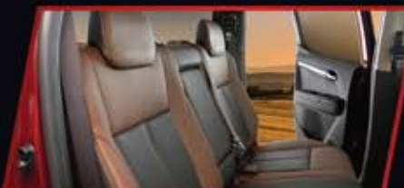
Improved rear seat angle for enhanced comfort