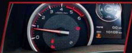
Occupant Detection Sensor for Enhanced Safety and encourages users about seat belt application