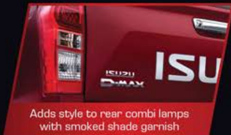
Adds style to rear combi lamps with smoked shade garnish