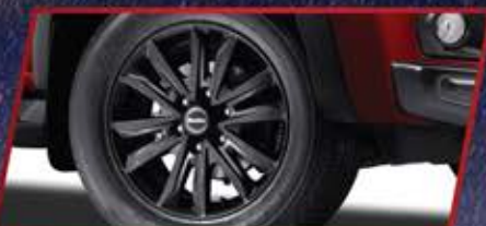
Sporty Matt Black Alloy Wheels

WITH BOLD NEW LOOKS AND ENHANCED FEATURES