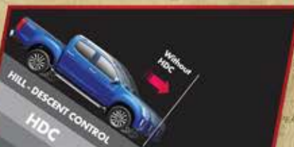
Hill Descent Control