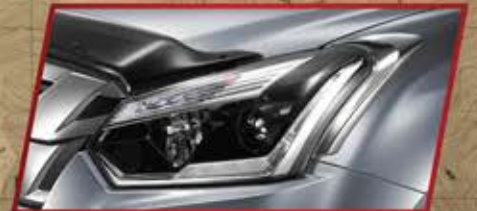
Head Lamp Garnish