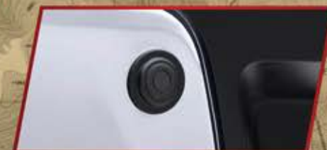
Rear Parking Sensor