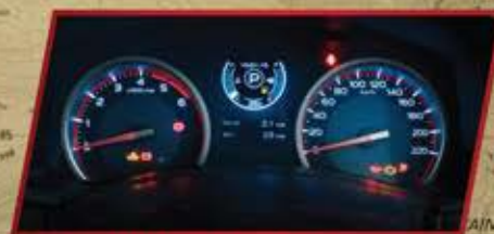
3D Electro-luminescent Instrument Cluster with Multi-information Display