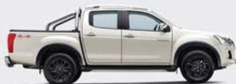
Silky White Pearl