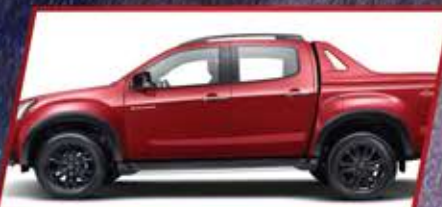
Sporty dark grey fender lip over Front and Rear wheel arches