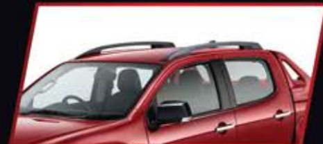
Roof Rail in Very Dark Grey Finish