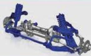
High Ride Suspension