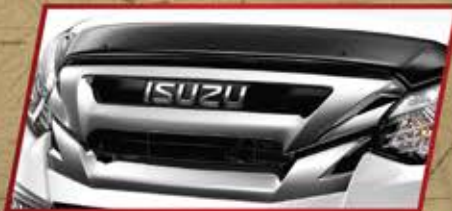
Engine Hood Protector