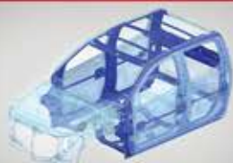
High Tensile Steel Body