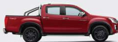
Red Spinel Mica