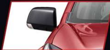
Dark Grey finish ORVM