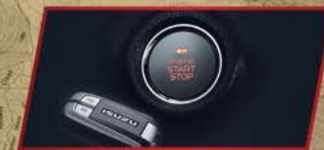
Passive Entry and Start System (PESS)