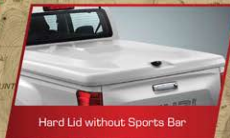
Hard Lid without Sports Bar