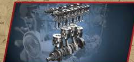
Diamond-like Carbon-coated Pistons and Injectors