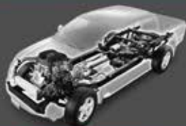
Isuzu Gravity Response Intelligent Platform (iGrip)