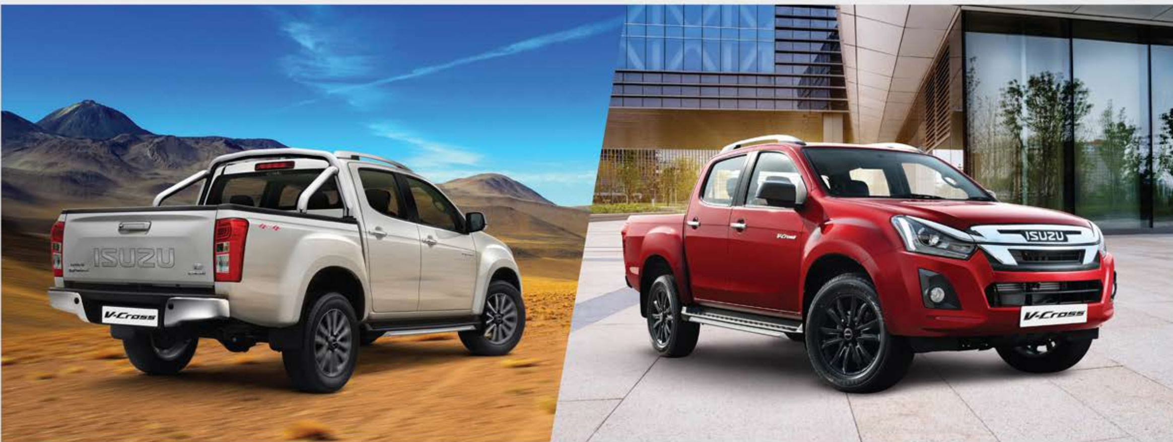
4 X 4 MT Z