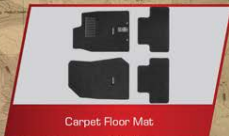
Carpet Floor Mat