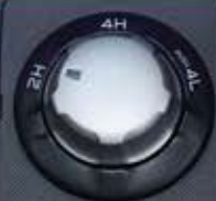
Shift-on-the-fly 4WD System