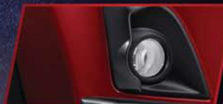
Dark Grey Front Fog Lamp Garnish